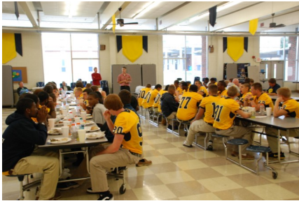
Players listening to the devotion