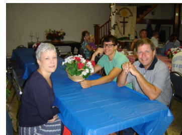
Full from Pancakes