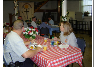
Thank you to the Firefighters