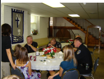
Thank you to the Police